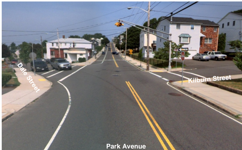
Park Avenue, Dale Street, and Kilburn Street intersection

The City of Revere requested technical assistance from the Boston Region Metropolitan Planning Organization (MPO) to review pedestrian safety improvements proposed for the intersection of Park Avenue, Dale Street, and Kilburn Street. Motorists turning left from Park Avenue onto Dale Street drive at high speeds because of the diagonal alignment of Dale Street, increasing risk to pedestrians in this intersection. The city is proposing construction of a traffic island on Dale Street to reduce the speed of vehicles turning from Park Avenue westbound. This purpose of this memorandum is to review this proposal; it includes an overview of the study location, issues and concerns, existing conditions, and refinements to the city's proposal.